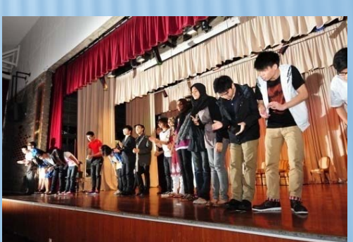
The entire cast takes a bow