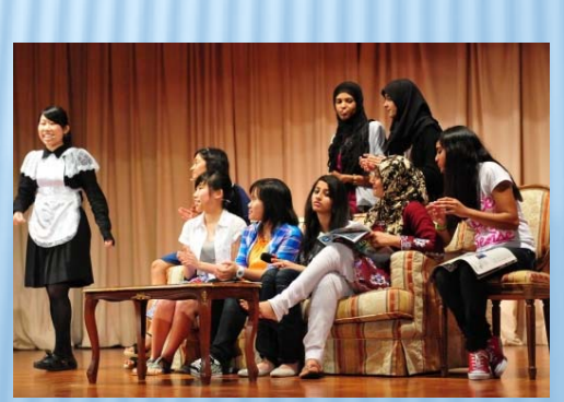
Most of the female cast members

Some of the girls from Islamic School performing