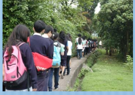
Tai Po New Town Field Study

Education Trip to Ocean Park with Arranged Workshop