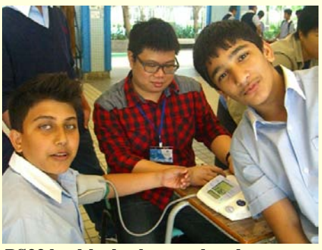
PS33 health check game booth

Fifteen Love & Care Ambassadors were selected to take part in the Multicultural Harmony Training Workshop in collaboration with Hong Kong Chrisitian Service. The workshop equipped them with the general knowledge of cultural differences among various ethnic minorities. To conclude the workshop, these ambassadors organized a sharing session on 19 December with their fellow S.1-S.2 Chinese students on issues related to different cultures with the ultimate aim of achieving multicultural harmony. The workshop will continue in the second term with more eyeopening outdoor activities held for our students.