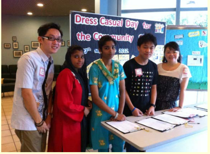
Dress Casual Day for the Community Chest