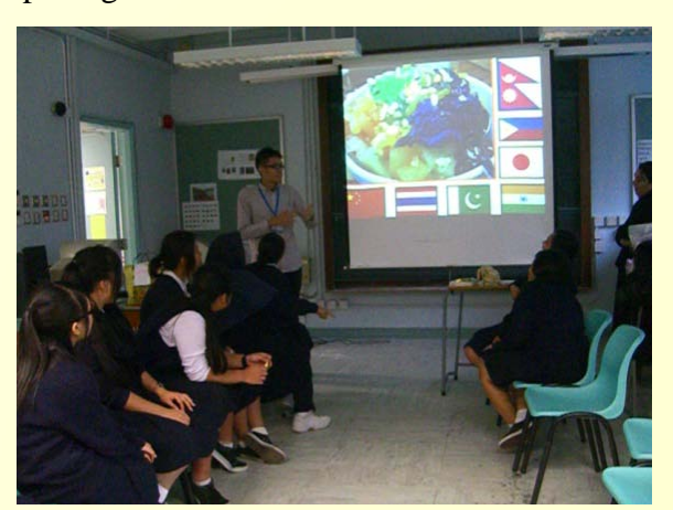
Multicultural Harmony Education led by Love & Care Ambassadors