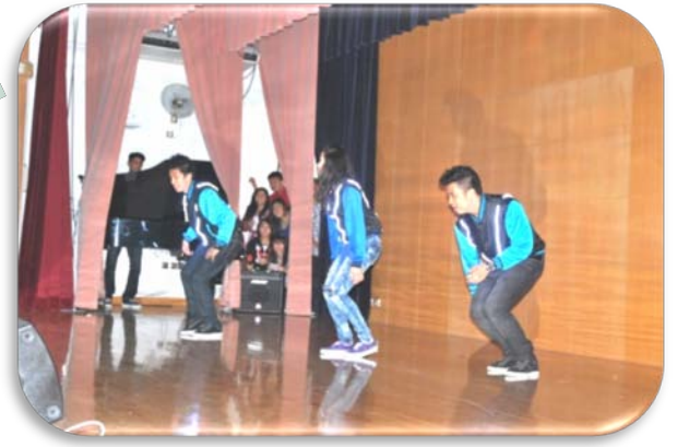
The Capinpins dance for us

This year's event showcased a wide range of talented students who put in long hours and intense practice to prepare for the spectacle that was on display and we look forward to next year's show with bated breath.