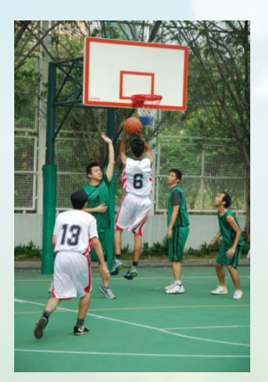
Real Friends Project 2012/2013 Basketball Friendly Match